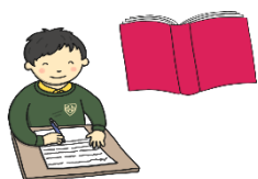
Literacy in Home Learning Pack

9:00 – 10:00: Online Learning via Spelling Shed, Sum Dog, Times Tables Rock Stars or Live Read Write Inc Sessions