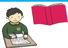
Maths in Home Learning Pack

10:30 – 11:00: Snack and Break (in a garden if possible)