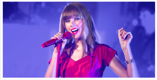
Taylor Swift is a pop and country music singer

Country music came from the southern United States. It often tells a story accompanied by string instruments, such as banjos, guitars and violins.