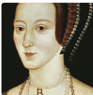
Off with Her Head!