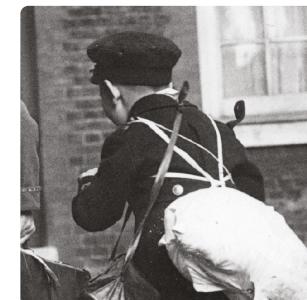
A Child's War